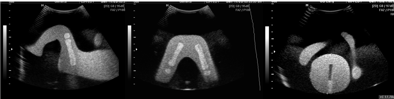
Femoral Length for Measurements