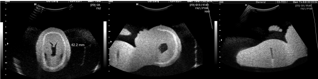
Axial Brain & BPD Measurement