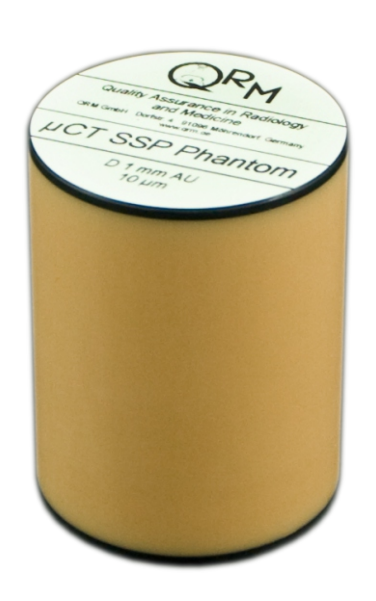
Micro-CT SSP Phantom

Biomedizinische Technik 50 (2005), 1192-1193